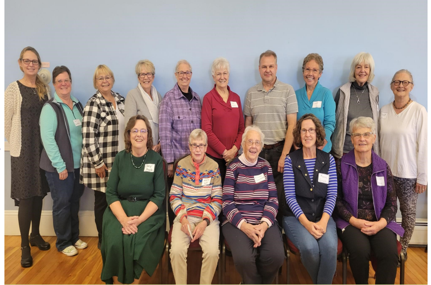
Direct Care Volunteer Celebration 2022

Family members thank volunteers for providing respite so that a family member can go shopping, take a nap, visit with friends, or go to their own appointments.